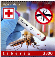
mosquito and blood sample