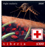
mosquito and blood cells