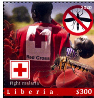
Red Cross worker

Size: 38 x 39 mm Notes: singles from collective sheet Price: C